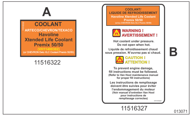
Figure 2: Decals with regard to new coolant

Vehicles filled with this new coolant can be identified by the presence of the decals indicated in Figure 2