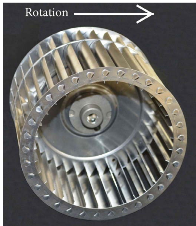
Right hand rotation