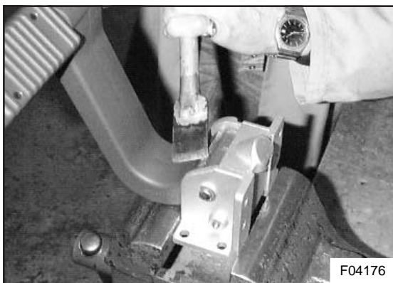
Figure 2: Shaving down locking slot edges