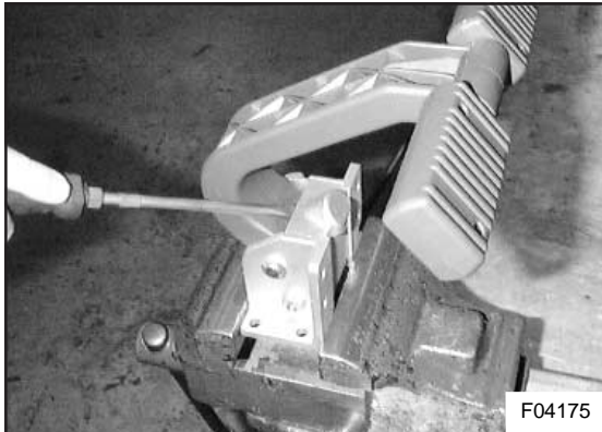
Figure 1: Freeing footrest from "up" position