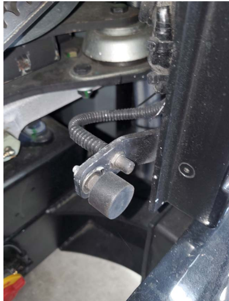
Right side sensor shown above, left side similar.

The message shown above on the MVP Dash Display alerts the driver if the door is left open.